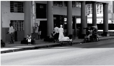
"Yaku Onba: Volume II" (HD - B/W - 2005 - 2017 - 49'28) (Hacere Saino - Making Saino - Se Faire Saino) (video installation - single screen - sound - loop)